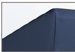
Dartex® cover with heat-sealed seams

Additional design features of Reusable Wedges include: