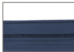
Raised border behind the bottom zipper prevents fluid infiltration