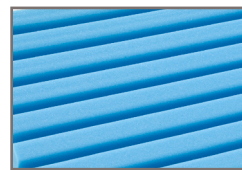
Contour cut foam for standard wedges