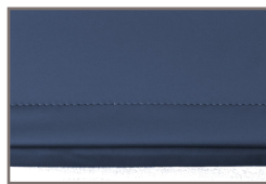
Waterfall Flap covers the top half of zipper enclosure